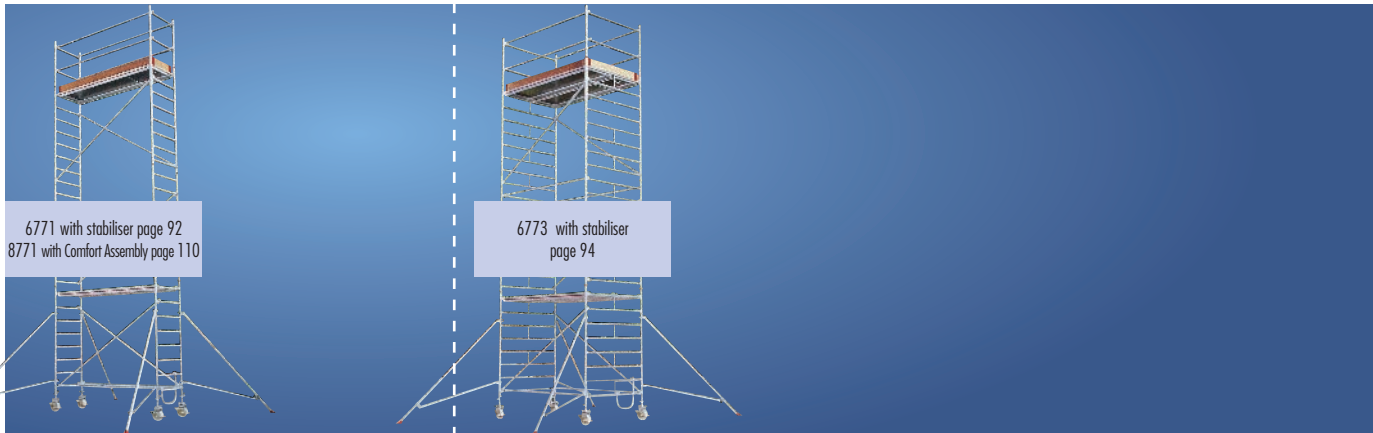
6771 with stabiliser page 92 8771 with Comfort Assembly page 110