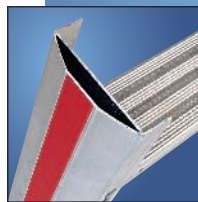
D-stile for even better, higher stability