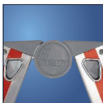
Steel joint with plastic cover