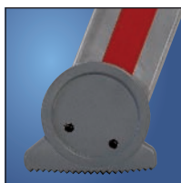
Anti-slip plastic feet