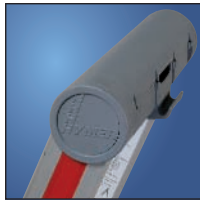
Spacious, practical, folding tool tray